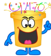
Soak n Wet