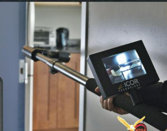
TACTICAL SEARCH POLE CAMERA (TSPC)