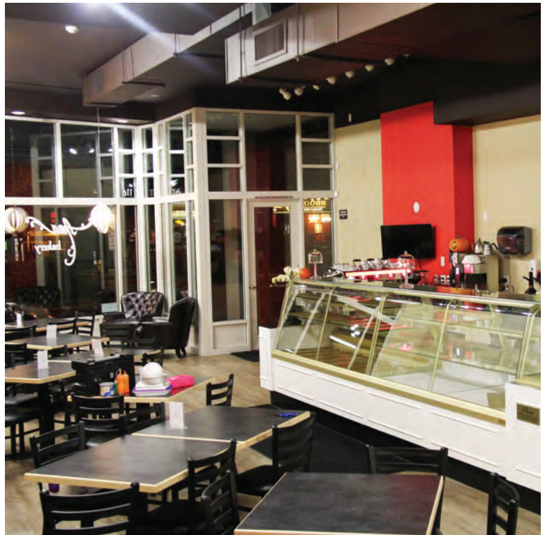
AURA BAKERY, KIRKLAND, WASHINGTON

Whether it's a casual, family-oriented restaurant or one requiring more elegant design, Magellan works to create a memorable dining experience for customers.