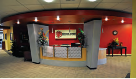
I-MATE, REDMOND, WA