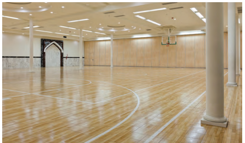
MUSLIM ASSOCIATION OF PUGET SOUND, REDMOND, WASHINGTON

Magellan understands the unique position places of worship have in the community. They serve to inspire and educate, and are important sanctuaries with unique needs. We work with leaders of these facilities to develop comprehensive design and planning solutions by evaluating project goals and balancing them with the available resources. We also provide guidance through the often complex process of site selection, financial planning, permitting, and construction. We aim to fulfill the vision and serve the needs of each congregation. Previous projects have included elements such as classrooms; gymnasiums; exterior and interior improvements; and flexible space to serve worship, and performance needs.