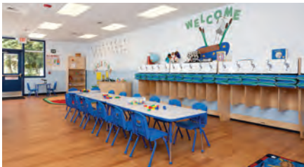
THE GODDARD SCHOOL, REDMOND, WA

Magellan has a successful track record providing school districts with design services for various facility improvements.