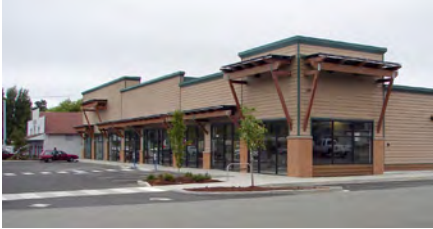
PORT TOWNSEND RETAIL, WA