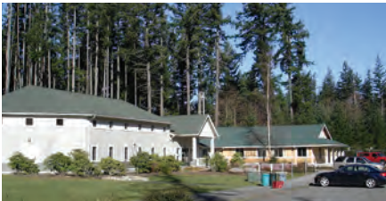
SHEPHERD OF THE HILLS, ISSAQUAH, WA