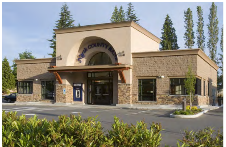
SEATTLE HILL CENTER, EVERETT, WA