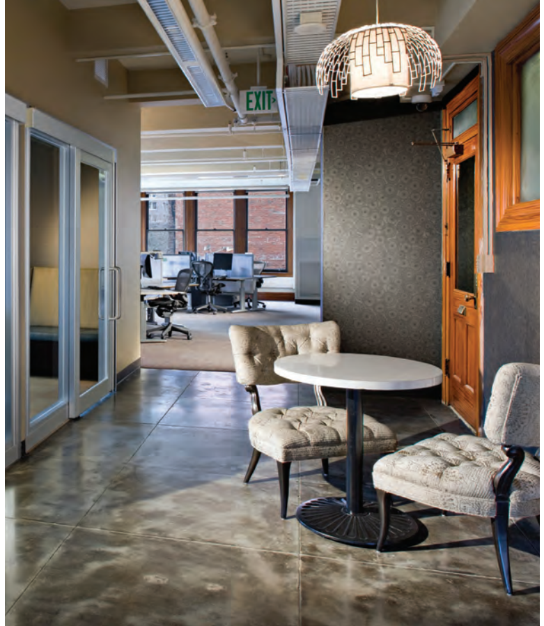
MICROSOFT SMITH TOWER, SEATTLE, WASHINGTON

Magellan works with businesses to create personalized workspaces that are as aesthetically pleasing as they are functional. Our work ranges from small modifications to major interior and exterior remodeling and additions/expansions. On each project, we guide clients through the sometimes complex permit process and provide them with construction-ready documents at completion. We regularly incorporate sustainable products and methods to suit each project's unique goals and budget.