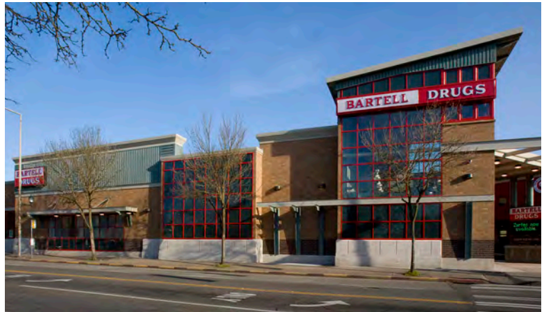
LAKE CITY RETAIL CENTER, SEATTLE, WA