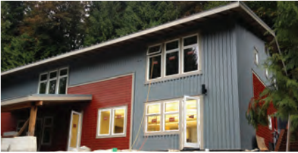
MONTESSORI CHILDREN'S HOUSE, REDMOND, WA