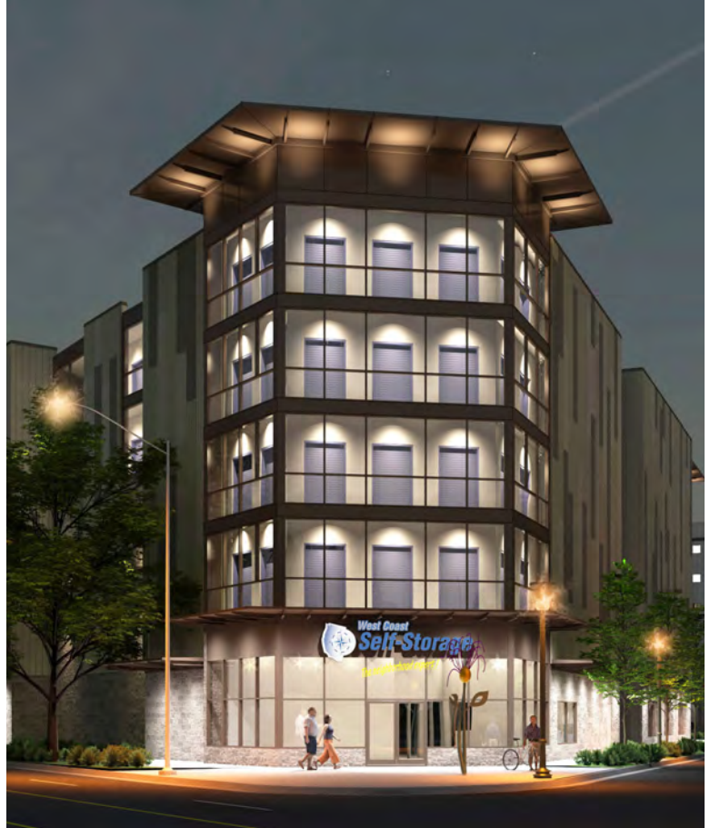
WEST COAST SELF-STORAGE RAINIER AVE, SEATTLE, WASHINGTON

Magellan Architects provides reliable design work for industrial and self-storage projects. We provide functionality in conjunction with creativity and innovation, and we believe that an industrial facility does not need to sacrifice aesthetics. We strive to design the best solution for the budget, and consider the surroundings of each facility when creating our designs. Whether for a ground-up design or a simple improvement, we can help make your objectives a reality. We assist and guide clients through construction administration, acquiring permits, and inspecting building sites, as needed.