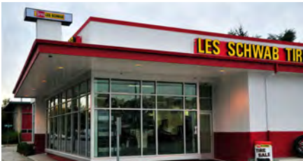
NOVILHO'S, BELLEVUE, WA

Magellan works with many retail chains and individually owned businesses on tenant improvement projects of varying size and complexity — ground-up design, interior and exterior remodels, additions/expansions, ADA compliance, and sustainable modifications. We integrate architecture, interiors, and space planning to develop functional solutions that address the needs of the staff and clients who will use each facility. Our attention to detail and consideration of each project's specific location, budget requirements, timeline, and future maintenance needs have earned us repeat business and a reputation for quality retail services.