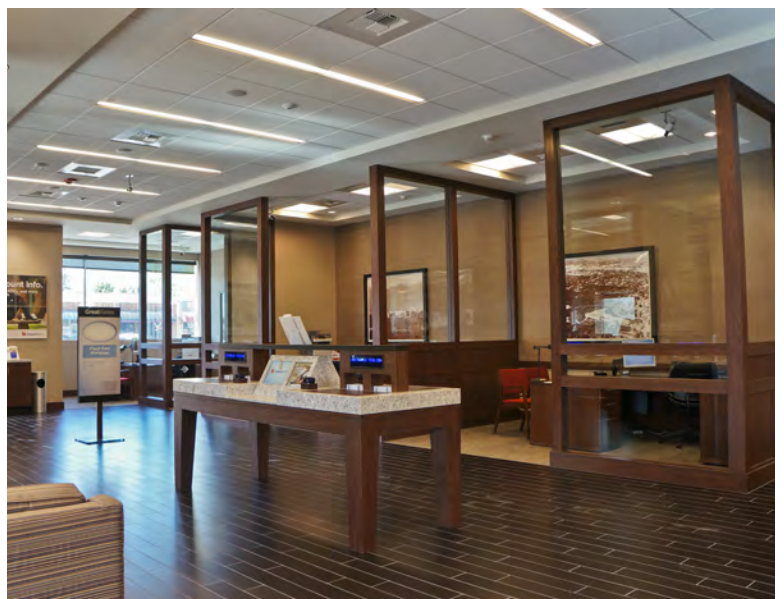
UNION BANK, SAN MARINO, CALIFORNIA