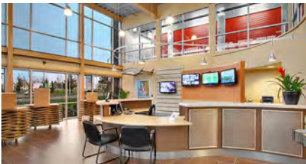
PREMIER SELF STORAGE, HILLSBORO, OR