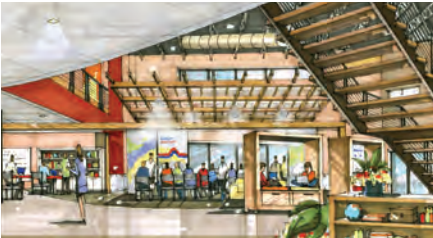
THE ROCK CHURCH, MONROE, WA