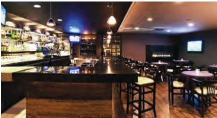
NOVILHO'S BRAZILIAN STEAKHOUSE, BELLEVUE, WA