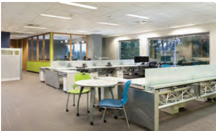
UNIFIED LOGIC, BELLEVUE, WA

Magellan works with businesses to create personalized workspaces that are as aesthetically pleasing as they are functional. Our work ranges from small modifications to major interior and exterior remodeling and additions/expansions. On each project, we guide clients through the sometimes complex permit process and provide them with construction-ready documents at completion. We regularly incorporate sustainable products and methods to suit each project's unique goals and budget.