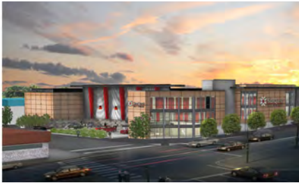
STORQUEST, TIGARD, OR

Magellan Architects provides reliable design work for industrial and self-storage projects. We provide functionality in conjunction with creativity and innovation, and we believe that an industrial facility does not need to sacrifice aesthetics. We strive to design the best solution for the budget, and consider the surroundings of each facility when creating our designs. Whether for a ground-up design or a simple improvement, we can help make your objectives a reality. We assist and guide clients through construction administration, acquiring permits, and inspecting building sites, as needed.