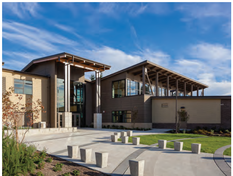
INTERNATIONAL COMMUNITY SCHOOL/ COMMUNITY ELEMENTARY SCHOOL, KIRKLAND, WASHINGTON