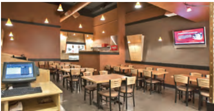
GARLIC JIM'S FAMOUS GOURMET PIZZA, VARIOUS LOCATIONS