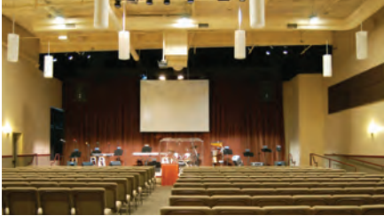
MEADOWBROOK CHURCH, REDMOND, WA