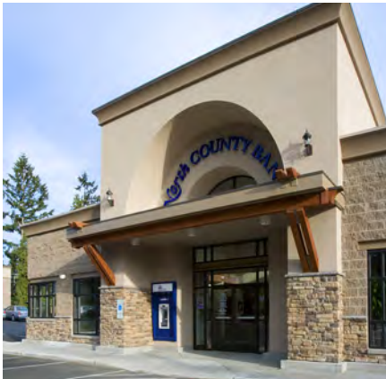
NORTH COUNTY BANK, EVERETT, WA

From update of existing facilities, design of new structures, or development of new branch prototypes, Magellan is adept at working with financial institution clients. Our established record of successful projects includes over 40 projects from 2006-2011 with Bank of America, Merrill Lynch; and also projects with North County Bank and Union Bank. We work closely with clients to maintain brand identity, while incorporating desired or required retail center aesthetics into the design.