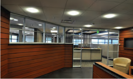
LWSO SUPPORT SERVICES OFFICE, REDMOND, WA