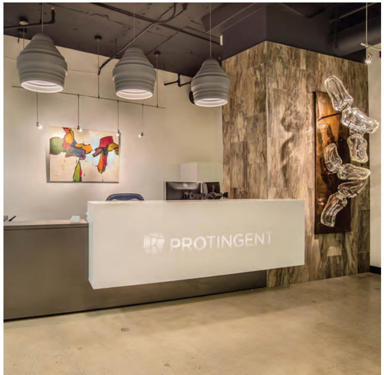
PROTINGENT, BELLEVUE, WA