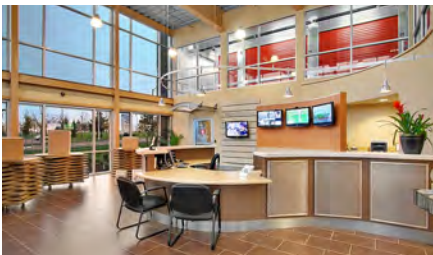
PREMIER SELF-STORAGE, HILLSBORO, OR