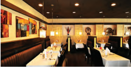
KANISHKA'S INDIAN RESTAURANT, REDMOND, WA