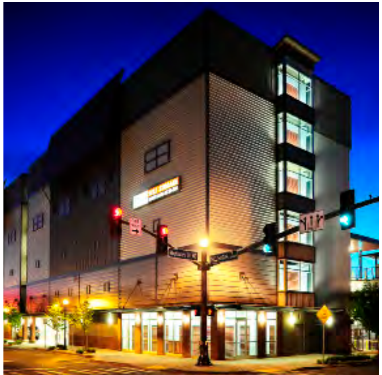
ISSAQUAH HIGHLANDS SELF-STORAGE, ISSAQUAH, WASHINGTON