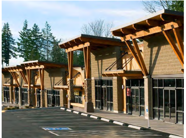
REDMOND RIDGE RETAIL, REDMOND, WA

Magellan works with many retail chains and individually owned businesses on tenant improvement projects of varying size and complexity — ground-up design, interior and exterior remodels, additions/expansions, ADA compliance, and sustainable modifications. We integrate architecture, interiors, and space planning to develop functional solutions that address the needs of the staff and clients who will use each facility. Our attention to detail and consideration of each project's specific location, budget requirements, timeline, and future maintenance needs have earned us repeat business and a reputation for quality retail services.