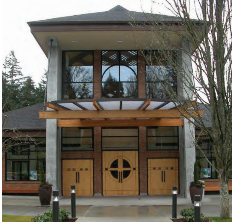
ST. JUDE PARISH, REDMOND, WASHINGTON