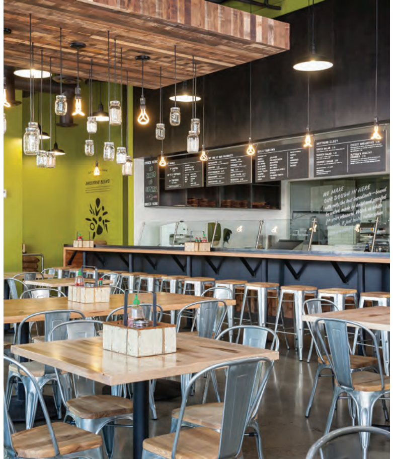
NAKED PIZZA, KENT, WASHINGTON