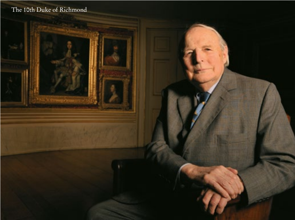
The 10th Duke of Richmond

won the Racing UK Top Jockey Award for the second year in succession, having partnered five winners during the 2017 Qatar Goodwood Festival. The 10th Duke of Richmond, Charles Henry Gordon-Lennox, passed away at the age of 87 on September 1. He saved and transformed Goodwood House and turned the Goodwood Estate, with the racecourse at its centre, into a thriving enterprise.