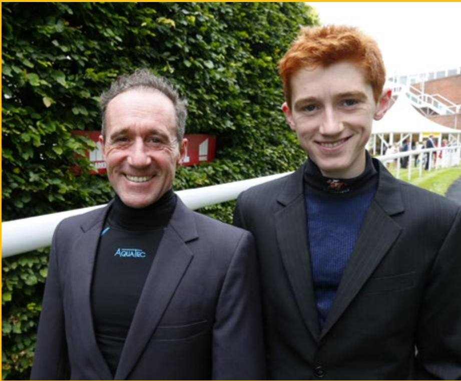
Total Qatar Goodwood Festival Wins (Current Jockeys & Prior To 2018 Qatar Goodwood Festival)