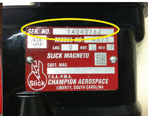
Figure 2. Magneto ID Label Date Code

* Changes from SB1-15 initial release in red