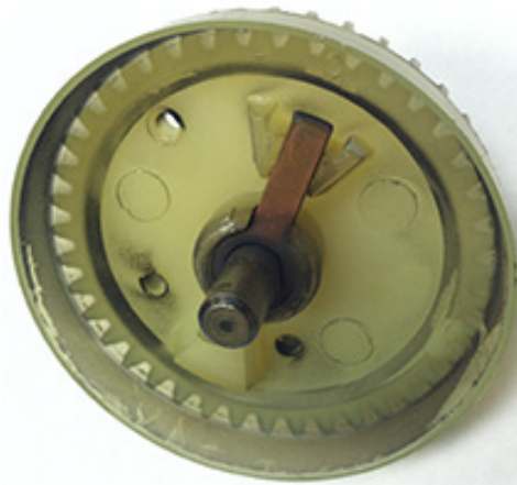
Figure 3. Affected K3008 Distributor Gear With Copper Electrode

COMPLIANCE: REMOVE affected distributor gear assembly in subject magnetos and REPLACE with replacement distributor gear assembly, K3008, as soon as possible, not to exceed the next 50 hours. Document Service Bulletin compliance as written entry in applicable Aircraft and/or Engine logbook.