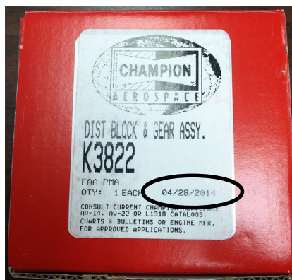
Figure 1. Replacement Kit Box Label Date Code

If it is not possible to confirm the version of the distributor gear that is installed in a given magneto from maintenance records, the magneto may be removed from the engine in order to have the housing and distributor block removed to allow visual inspection of the distributor gear. Distributor gears with Copper electrodes must be replaced with distributor gears with Monel electrodes.