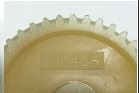
Figure 4. K3008 Distributor Gear Marked 510406 (Backside)

* Changes from SB1-15 initial release in red