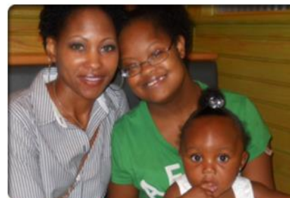
Caring for Your Child

The Catalyst Center has produced a policy brief -- Expanding Access to Medicaid Coverage: The TEFRA Option and Children with Disabilities -- that clarifies the differences and similarities between TEFRA and Home- and Community-based Services waivers.