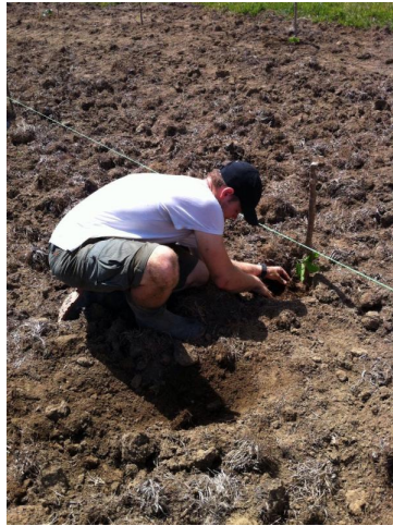
Planting Passion Fruit Vines

The good news is that they have been planted; the really good news is that we expect them to bear much fruit; the really, really good news is that the produce will be a great source of nutrition for the poor as well as providing a revenue stream for the