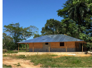
Property Manager Home on Passion Fruit Property

training in Nagua, Dominican Republic and 3 months service with a recognized PAOC global worker in a location of the candidate's choice somewhere within the Latin America/Caribbean region. The process and training works toward ensuring that a call to ministry/missions and leadership in the local church is confirmed and solidified.