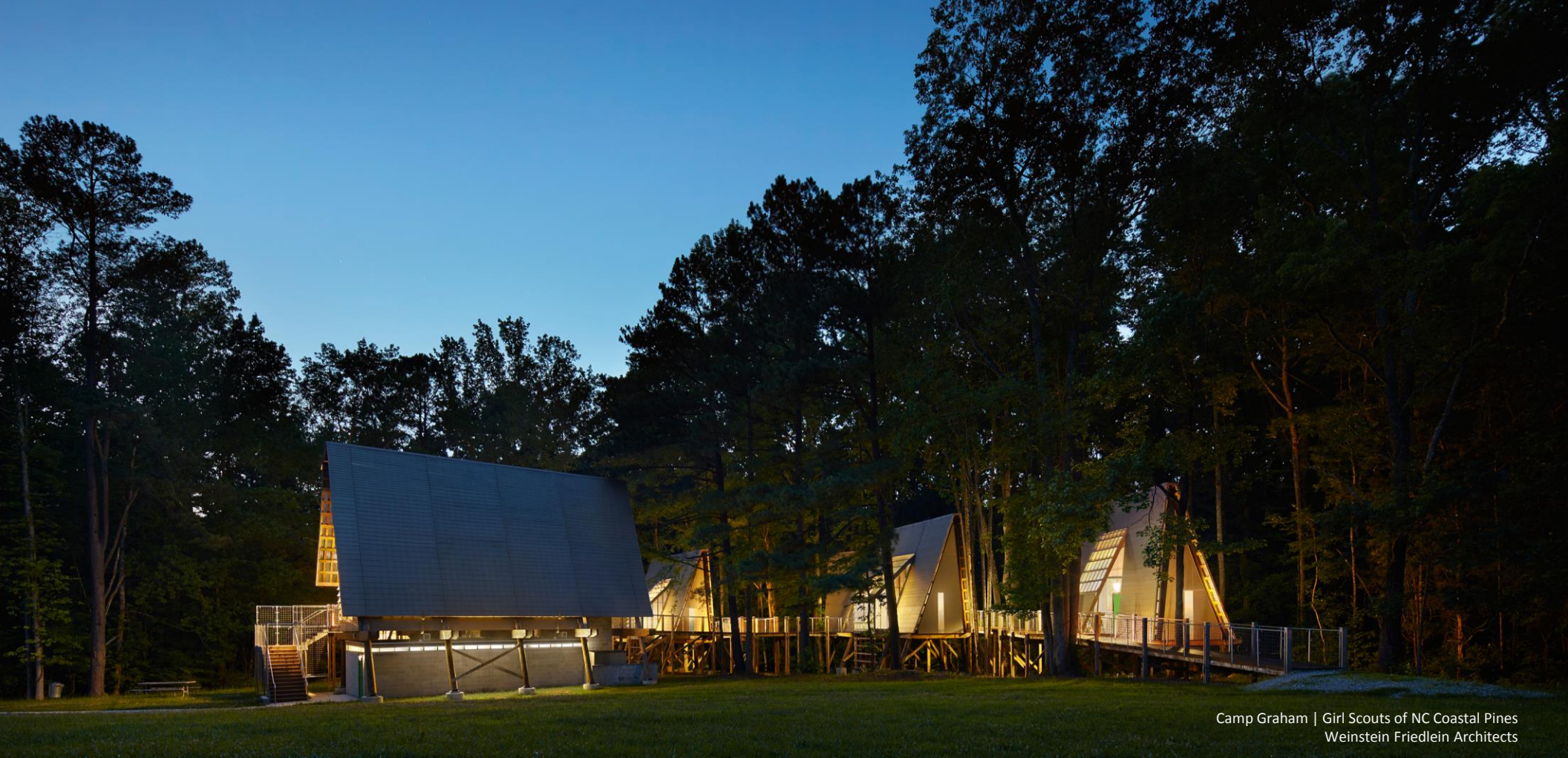
Camp Graham | Girl Scouts of NC Coastal Pines Weinstein Friedlein Architects