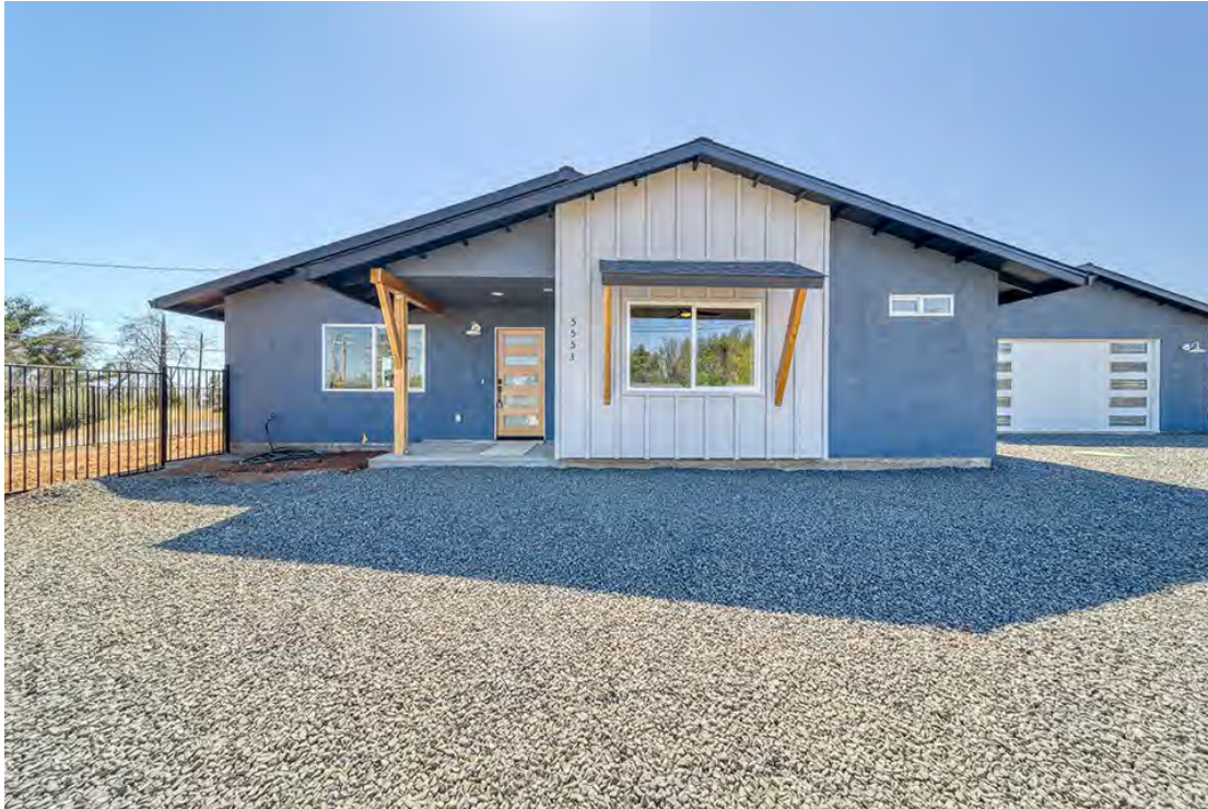
New Houses by Experts in Your Home