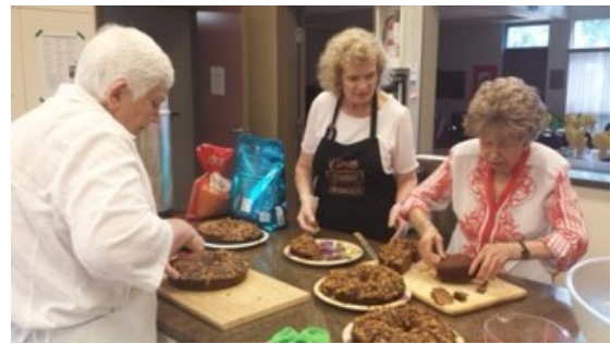
Walnut Raisin Cake