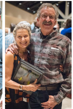
Allen & Mary Dee Dodge Excellence in the Arts