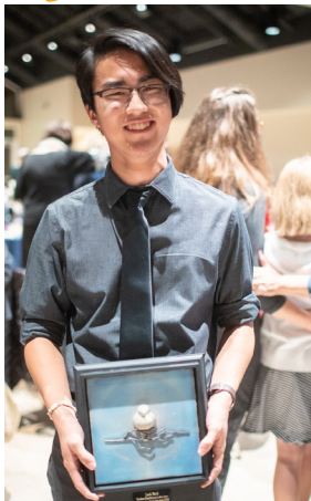
Jack Bird Student Excellence in the Arts