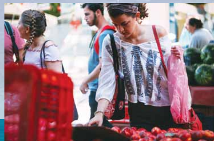
Experiential language class at the Laiki market