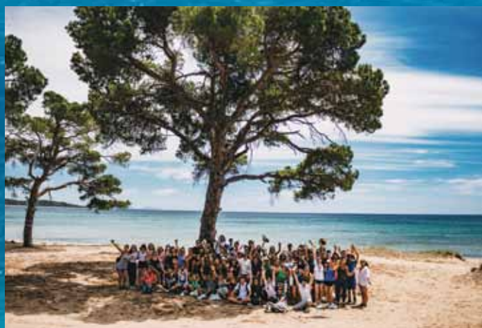
Schinias Beach, Athens

National Hellenic Society Heritage Greece® Program June 07-24, 2018