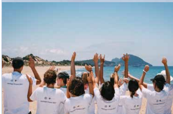
At Koukounari Beach, Messinia

* Greek descent is defined as having one or more parents, grandparents, or great grandparents born in Greece. Please note that siblings or first cousins of past and/or current participants, who meet the program's eligibility criteria, may participate in Heritage Greece 2018 on the condition that they reimburse NHS for all expenses related to their participation.