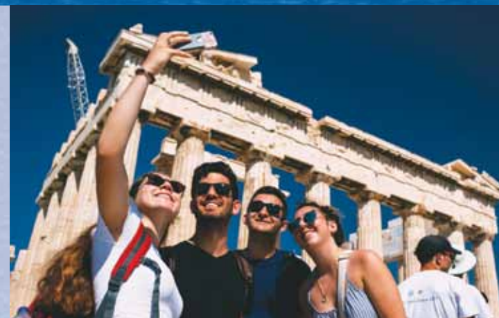
Selfie time at the Parthenon

The Heritage Greece Program is the NHS' contribution to keeping the Greek heritage and identity vibrant and relevant.