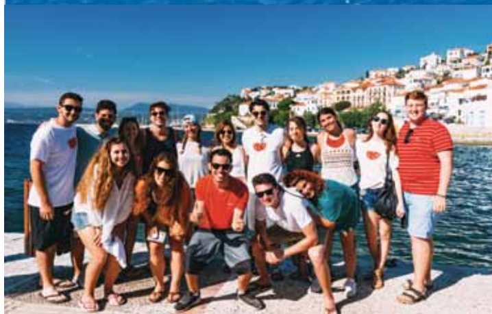
At Pylos, Messinia