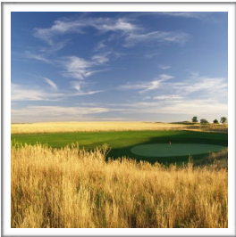
Men's Club Wednesdays

12:30 shotgun start Bring $30 for cash game Lunch available at 11:30