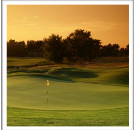
9 and Wine Mondays