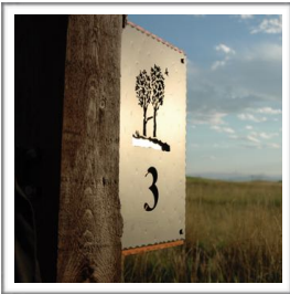
Women's Club Thursdays

12:30 shotgun start Bring $30 for cash game Lunch available at 11:30