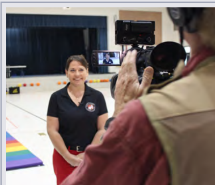
The project received national attention including the Virginia Farm Bureau station.