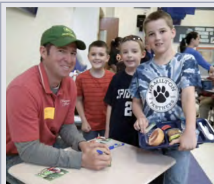
Farmers became famous at the local elementary schools. Students lined up to get their signatures.