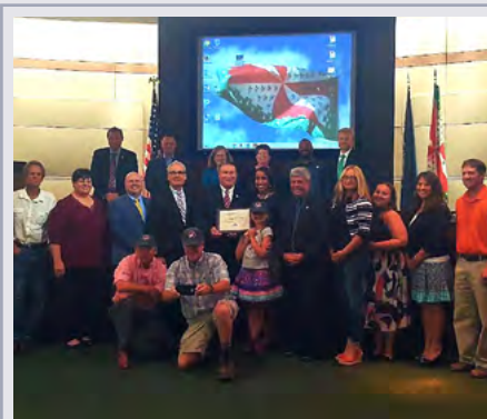
The county received an Achievement Award from the Virginia Association of Counties for our farmer trading cards.