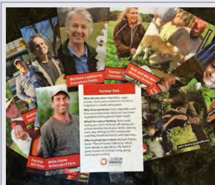
Ten farmers were featured in the inaugural Loudoun County farmer trading card initiative.