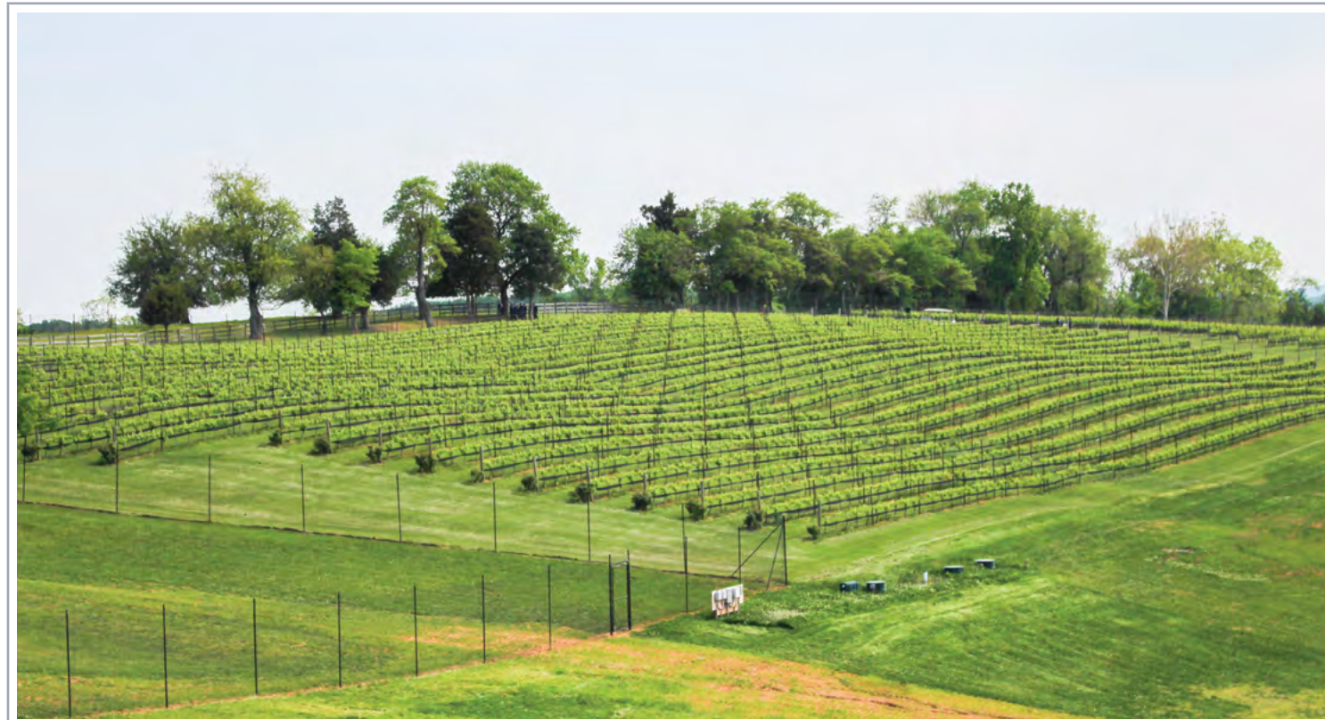
According to Visit Loudoun, the county's tourism arm, nearly 1,400 tons of grapes were produced in Loudoun in 2015, with 541 acres bearing vines.