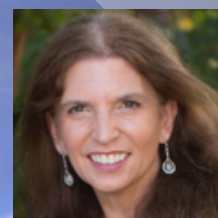
Sarah Catz Center for Urban Infrastructure