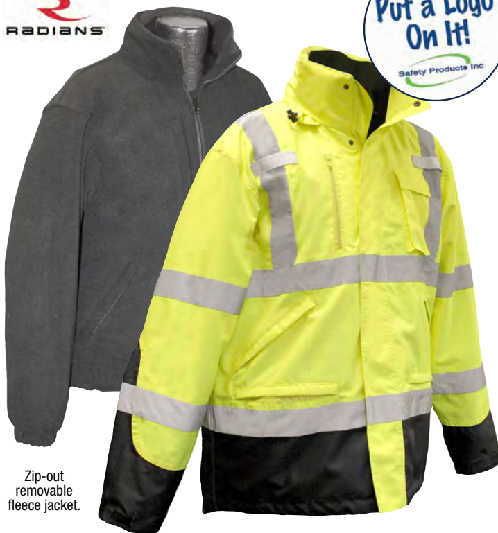
Zip-out removable fleece jacket.