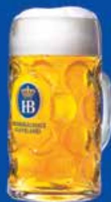
LIGHT Less alcohol but full in taste 3.8% ABV