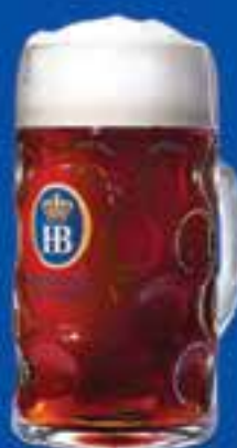
DUNKEL Light bodied & easy to drink 5.5% ABV