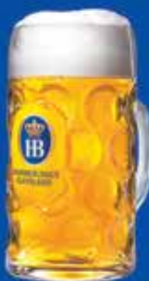
LAGER A simple full flavored lager 5.2% ABV