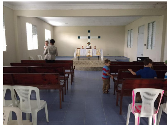
Freshly painted sanctuary in Palmar Arriba.