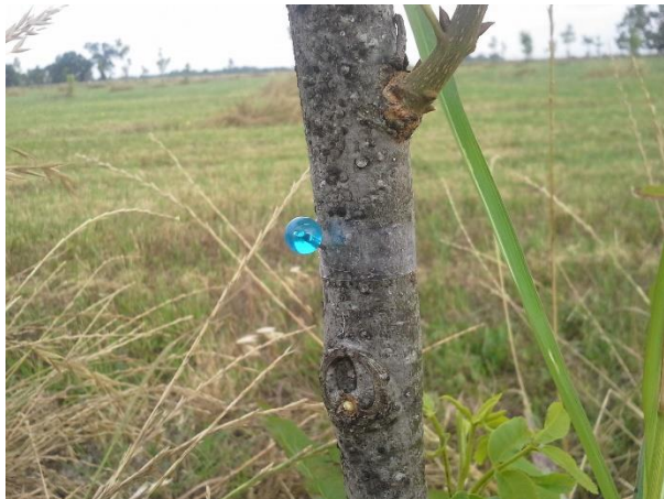
Figure 2. Double-sided sticky tape secured with push pin to monitor scale crawlers

highly refined light summer oils, pecan is considered an oil sensitive crop and any oil application needs to be restricted to the late dormant season.