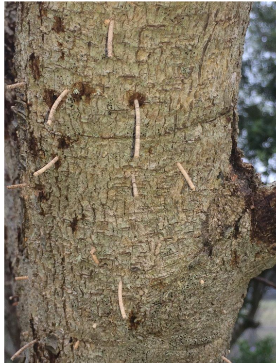
Figure 4. Toothpick like structures created by female ambrosia beetles.

Infestation usually first become apparent in the spring when newly infested trees either fail to leaf out or the tree leafs out but the new foliage soon wilts.