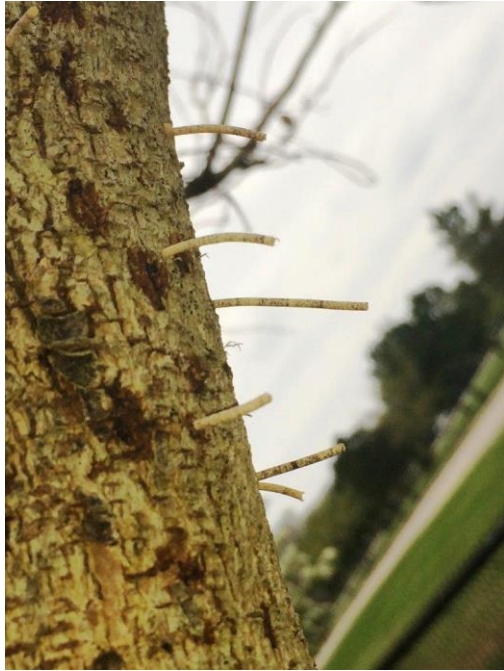
Figure 5. Evidence of ambrosia beetle infestation

Removed trees should be destroyed (burned, chipped, buried, etc.) rather than just tossed on a brush pile. The attached pictures were taken recently in Galveston county so activity has already started.