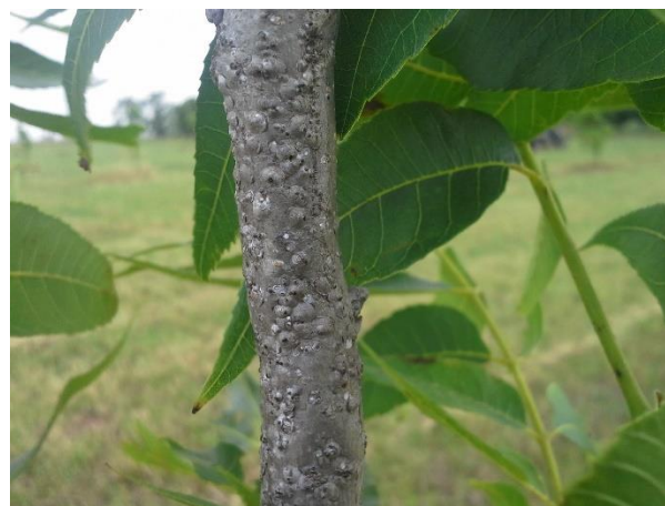
Figure 1 Young pecan tree with heavy scale infestation

These insects feed by inserting their mouthparts or styles into the conductive tissue of the tree and feed on the plant sap. They do not produce any honeydew. Heavy infestations can cause limb dieback and will reduce overall tree vigor.