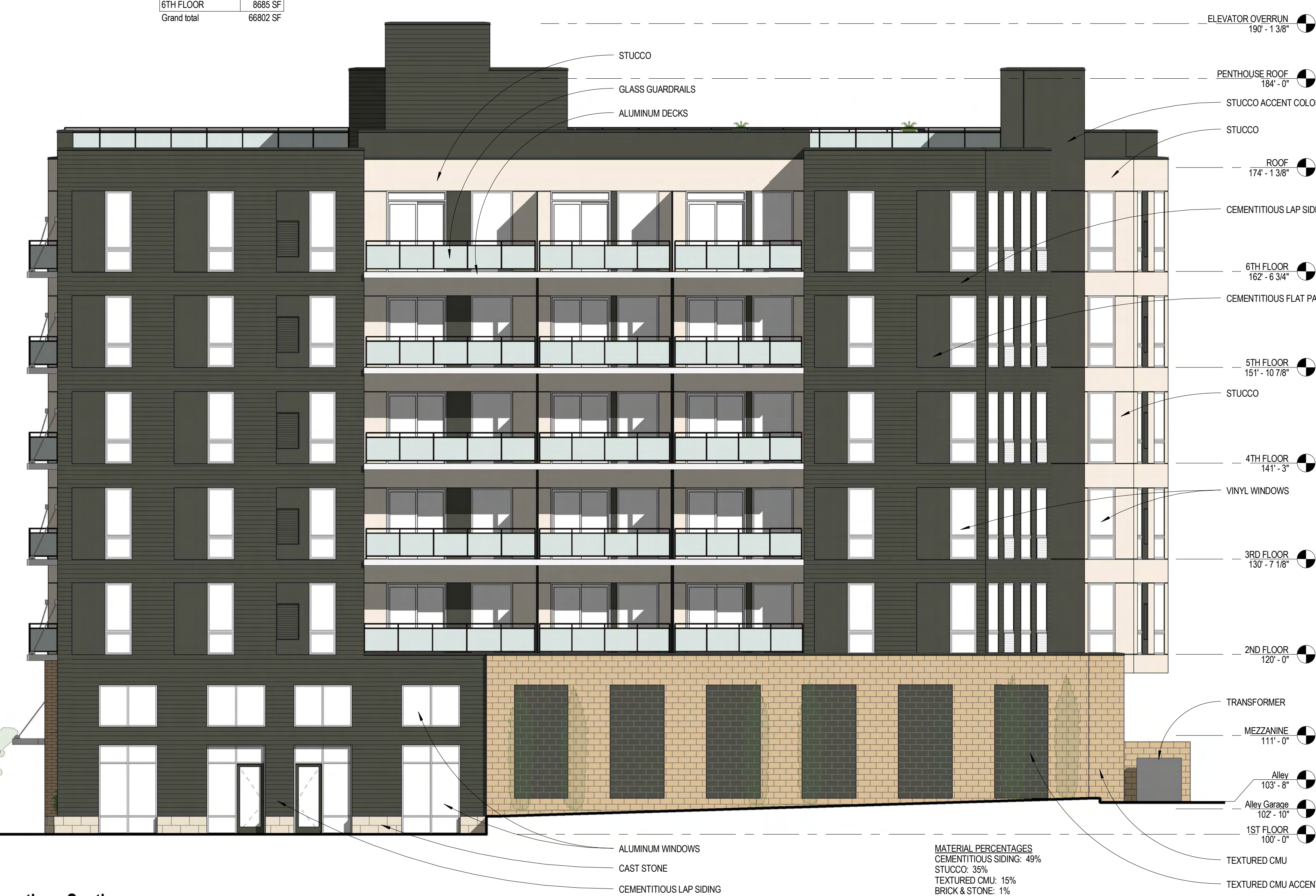
Elevation - South 1/8" = 1'-0"