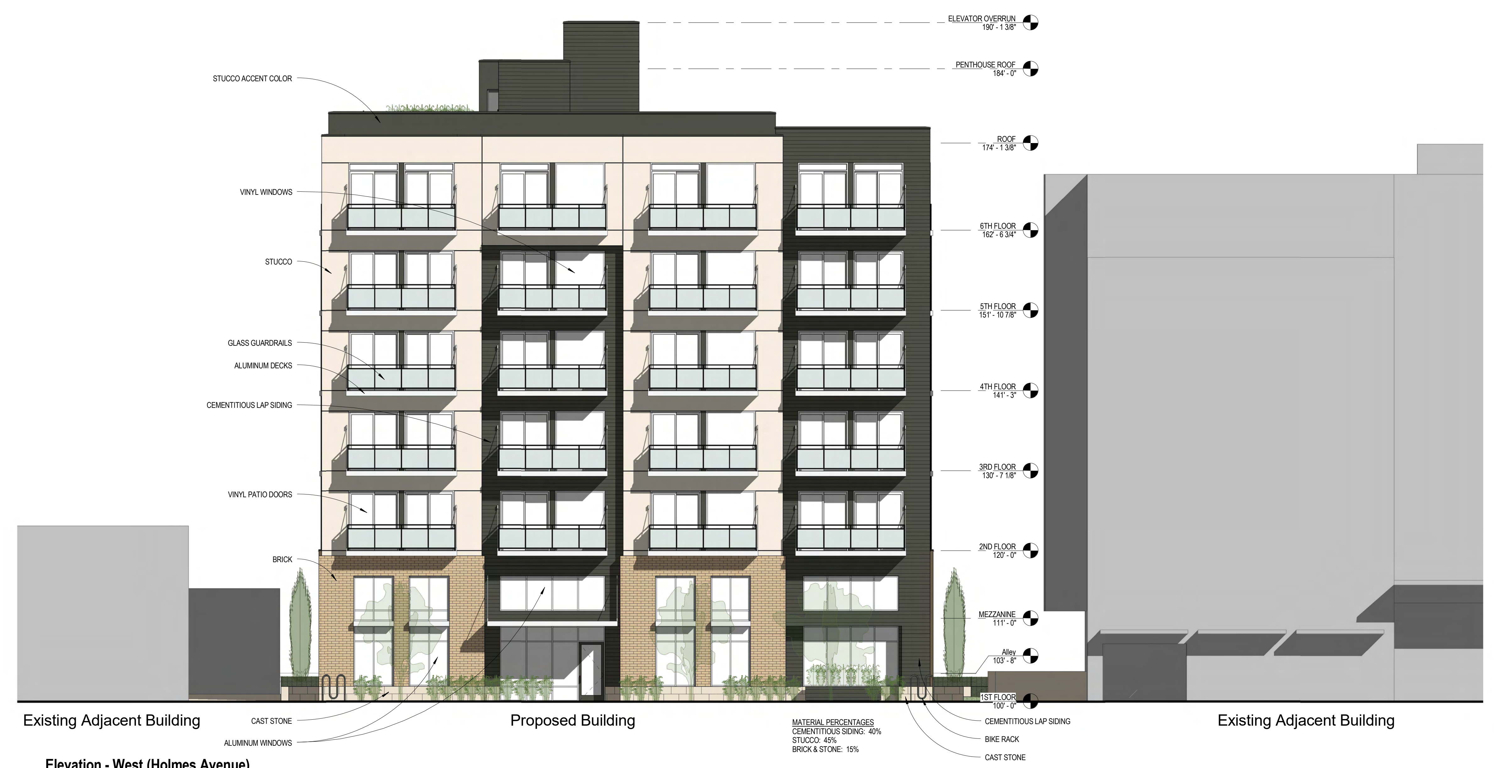
Elevation - West (Holmes Avenue) 1/8" = 1'-0"