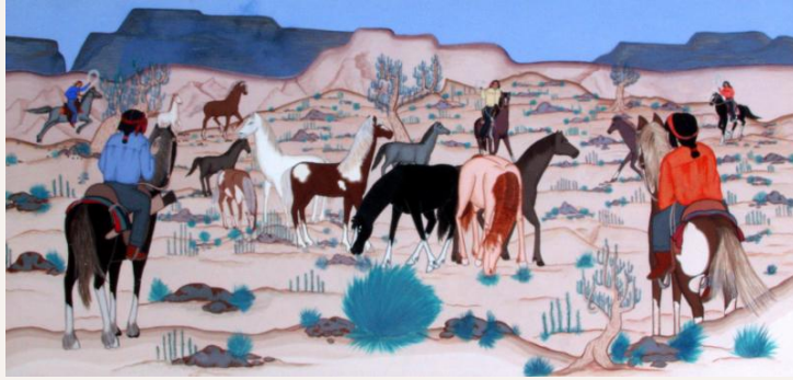
Men and Boys Herding Town Horses, Pablita Velarde, ca. 1940 Casein paint on masonite. L 38, W 20 cm. Bandelier National Monument, BAND 655

Did you know...Pablita Velarde (Santa Clara) painted over 70 paintings under the WPA program for the Bandolier Museum in the late 1930s–early 1940s.