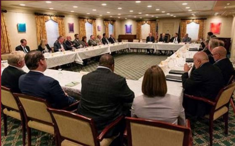
Governor Ricketts, EPA Administrator Pruitt, agriculture, county and business leaders from across Nebraska discuss the future of the Waters of the U.S. (WOTUS) rule.