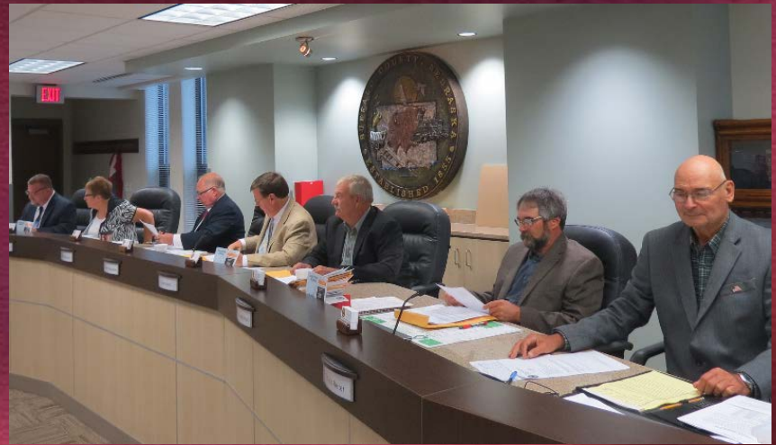
Buffalo County Board of Commissioners Meeting