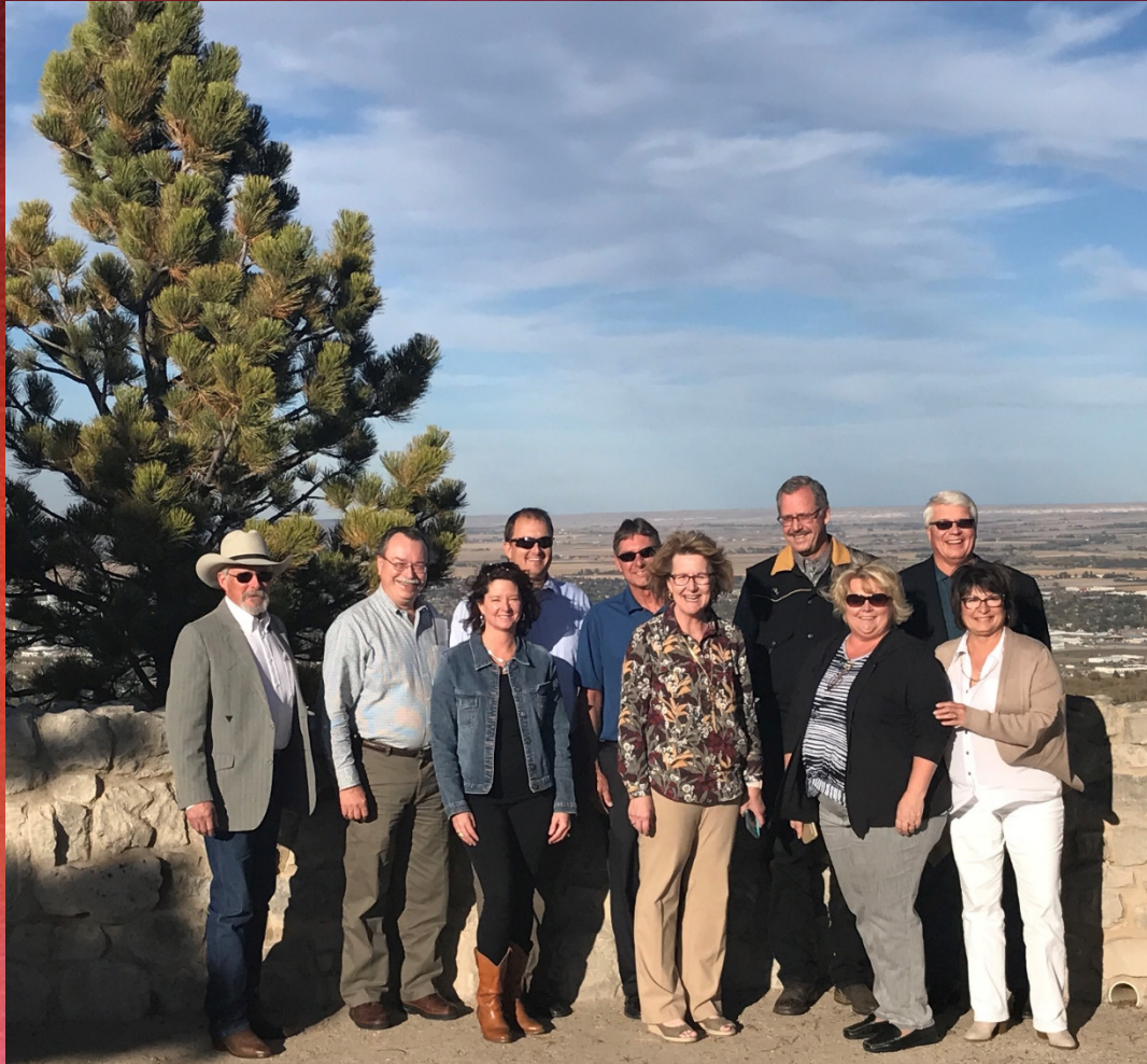
NACO Board, Legislative Conference, October 2017 ~ Gering, Nebraska