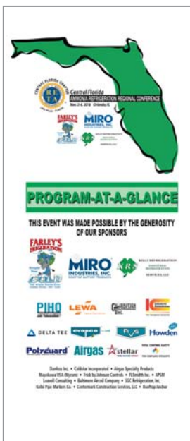
Program-at-a-Glance All sponsors featured