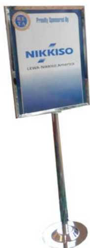
Silver Sponsor Sign 22"x28" • double sided