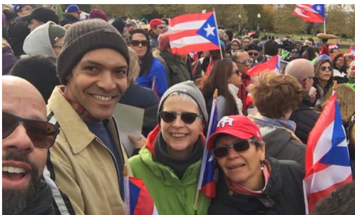
Thank you to all the Middle members who traveled to the Unity March for Puerto Rico in Washington DC! Support the effort by asking Congress to Rescind the Jones-Shafroth Act, Cancel Puerto Rico's Immoral Debt, and Approve Federal Resources to Rebuild Puerto Rico—sign the petition at bit.ly/bit.ly/JusticePR .