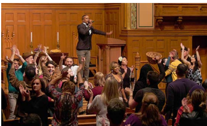
Fundraising for Puerto Rico and Virgin Islands continues. The Collegiate Church of New York made an initial donation of $10,000 for water filtration in Puerto Rico, and pledged to match each dollar Middle Church raised up to an additional $15,000. Thanks to your generosity and efforts like our MOSAIC concert, we have surpassed our goal for a total of $20,517.54, bringing the overall total in matched and raised funds to $45,517.54. We will continue to collect donations until December 3.