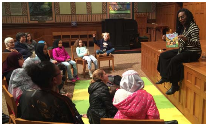
Our Children's Multicultural Book Fair gathered many from our East Village Interfaith Group for an afternoon of fun. Children and their families shared activities, enjoyed readings, and sampled many books featuring the diverse cultures of our city.