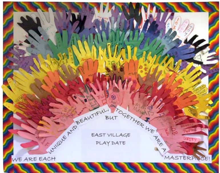
A mural made by children at the January Interfaith Play Date.