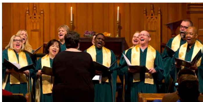
You can experience Middle Church worship online each week. Listen to the audio podcast of the entire worship each week on our website: middlechurch.org/about/blogs/middle-church-celebrations . Watch video of the entire worship in the video section of our Facebook page. View songs and sermons at YouTube.com/MiddleChurch . Please follow us on Twitter, Facebook, and Instagram to stay connected throughout the week.