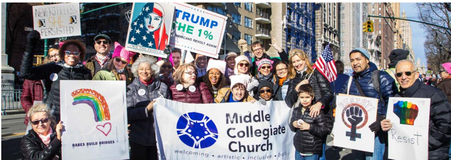
Middle congregants participated in the New York City Women's March on January 20. We sang songs like "Rich Man's House," "Woke Up this Morning with My Mind Stayed on Freedom," "Jesus Is a Rock in a Weary Land," and "Over My Head," and took the spirit of Middle Church and our hunger for justice to the streets. It was fun to see the joy and the dance that the music evoked from those near us.