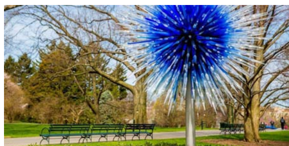
Image: Dale Chihuly, Sapphire Star (detail), 2010, 92 x 93 x 92 in., The New York Botanical Garden, installed 2017