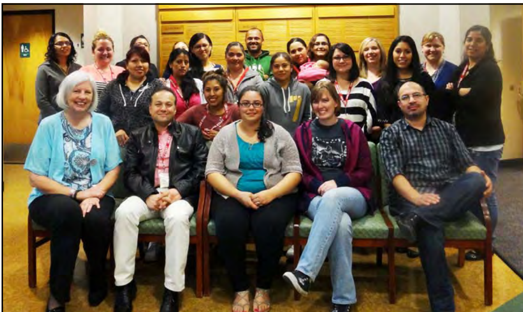
2014-15 Head Start Policy Council

The Head Start Policy Council is made up of parent representatives elected from each of our program sites. Policy Council shares the responsibility of program governance with our Community Action Board of Directors and our staff. Parents who participate develop leadership skills and contribute an essential voice to program decisions. Policy Council parents serve on hiring committees, review and approve financial reports and grant applications, and serve as liaisons to our Board and to the community. They represent our program at the Oregon Head Start Association and advocate for Head Start at state and local levels.