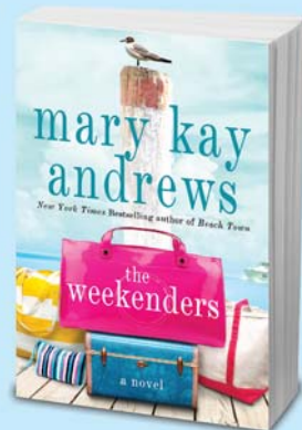
The Weekenders NOW IN PAPERBACK • MAY 2, 2017!