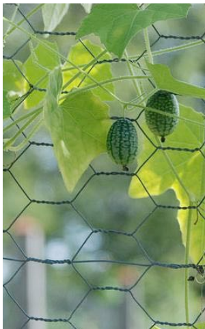
watermelon cucumber from Tina Duncan's garden

Wednesday January 4, 2017 9:30 am coffee 10:00 am program New Canaan Nature Center