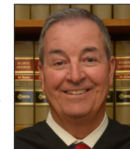
Michael Forte Chief Judge, Rhode Island Family Court

What are the policy-makers doing to address the issues?