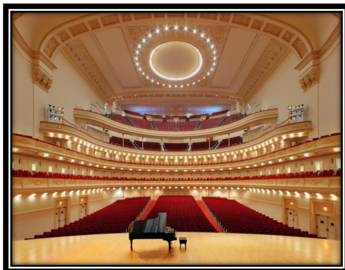
Historic Carnegie Hall, New York, USA

A concert appearance in historic Carnegie Hall in Spring 2019, as part of MidAmerica Productions' 36 th Season of Concerts with the New England Symphonic Ensemble. Also, an appearance during the 15 th Annual International Festival of the Aegean during the summer of 2019 in an opera production or oratorio with the Pan-European Philharmonia of Warsaw.