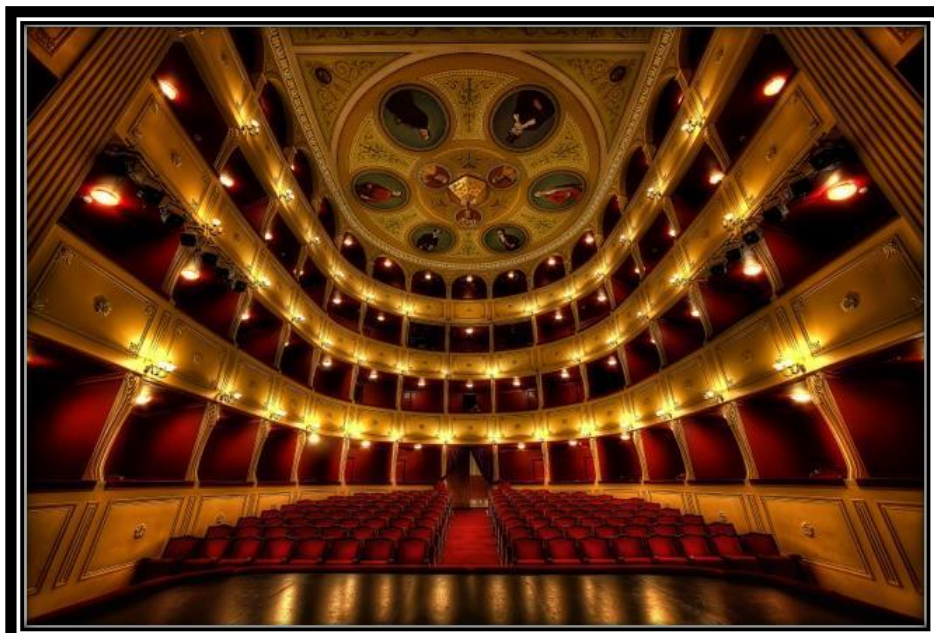
Apollo Theater - Hermoupolis, Syros, Greece

A maximum of 10 finalists will be selected to appear on July 29, 2018, at the Apollo Theater in Syros, as part of the 14 th Annual International Festival of the Aegean.