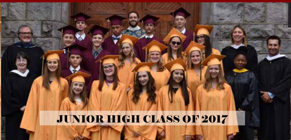
JUNIOR HIGH CLASS OF 2017